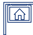
Real Estate Management

A SINGLE SOURCE FOR INSURANCE COVERAGE, RISK ENGINEERING SERVICES AND CLAIMS SUPPORT.